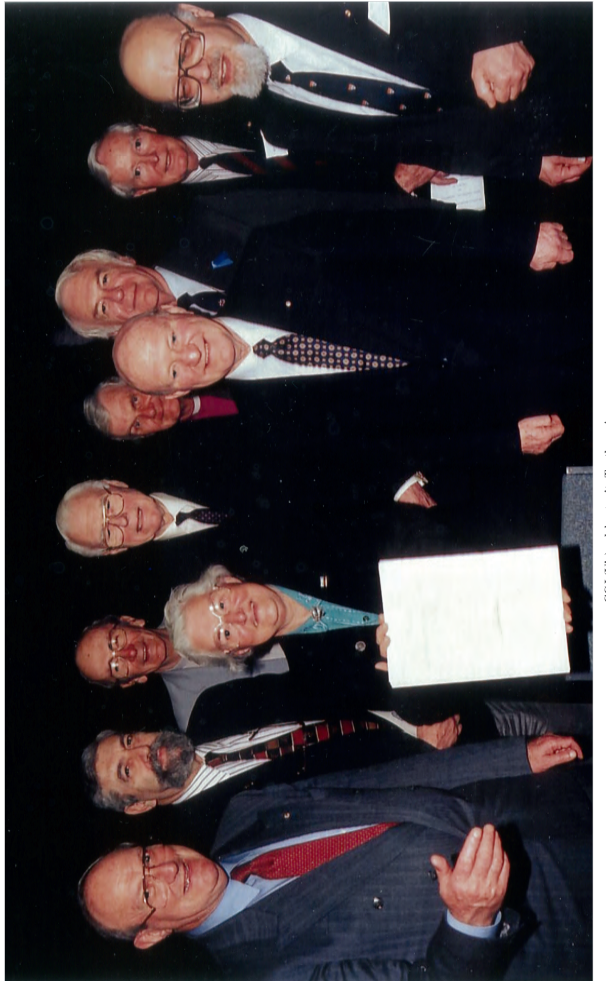
CCJ (Vic) celebrates its Tenth anniversary